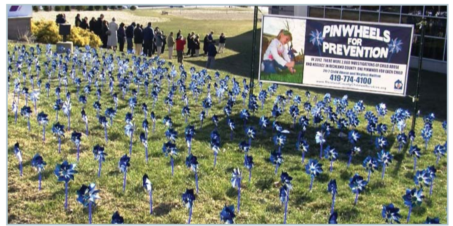
The lawn outside of the Mansfield Area Y again hosted the agency's "Pinwheels for Prevention" display during April.