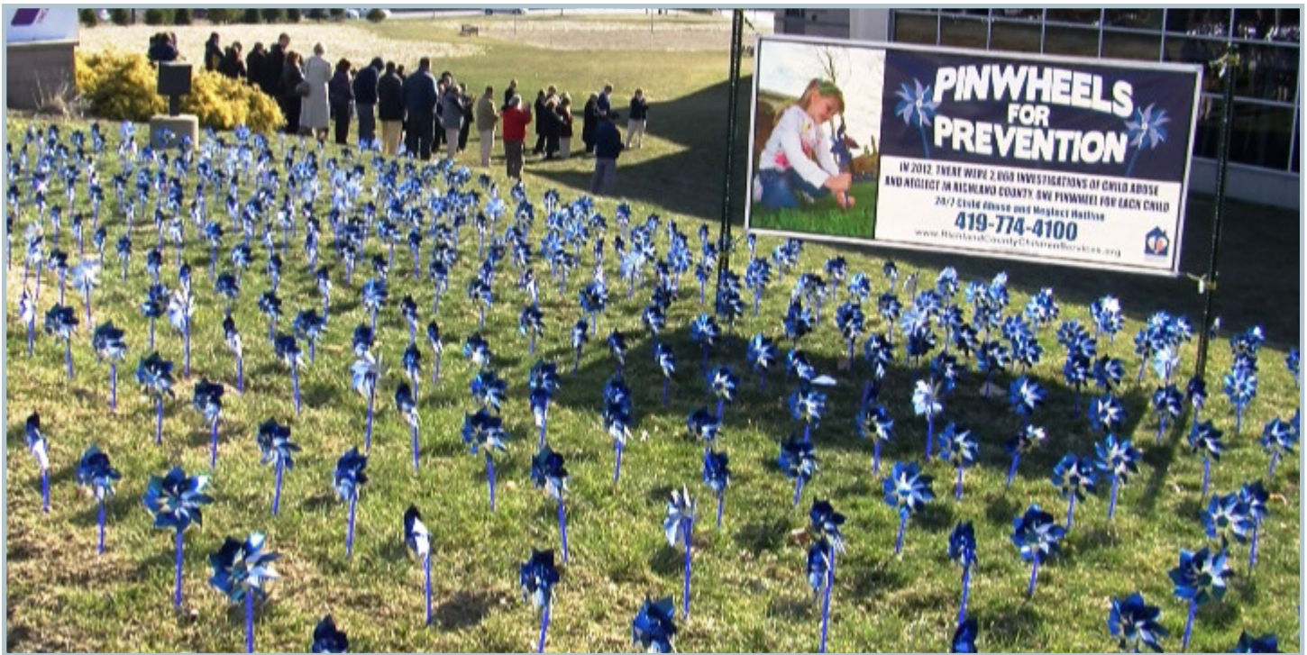
The lawn outside of the Mansfield Area Y again hosted the agency's "Pinwheels for Prevention" display during April.